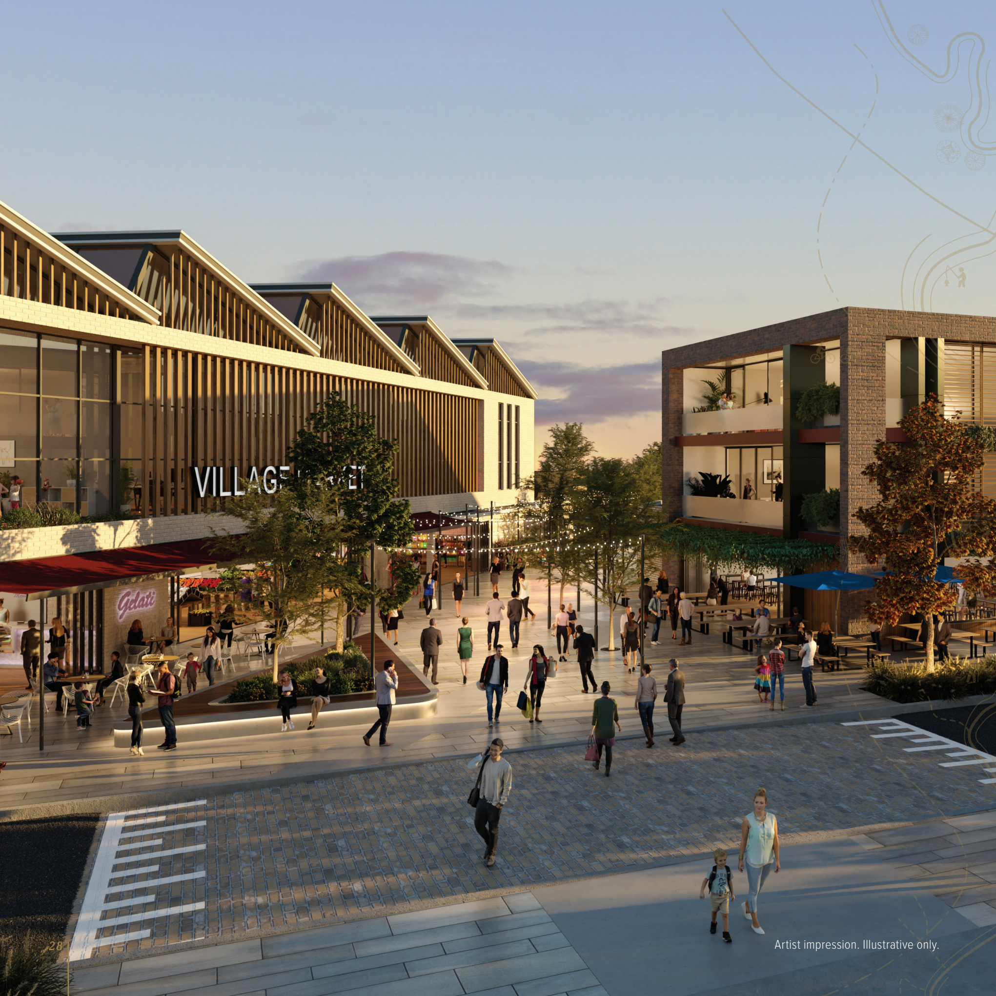
Artist impression. Illustrative only.