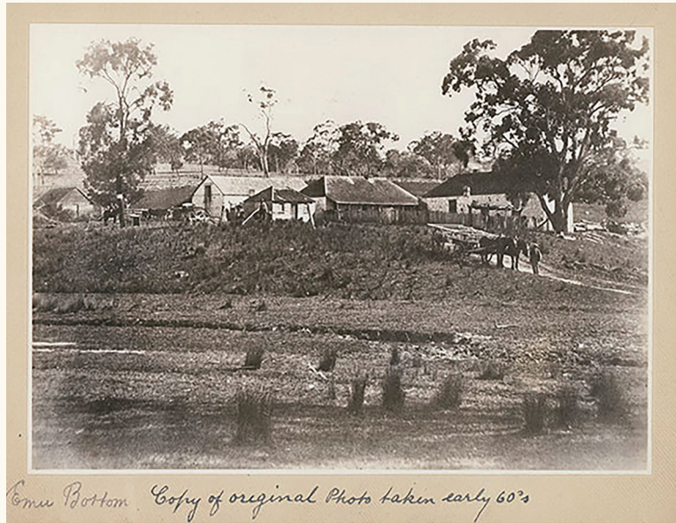
Emu Bottom. Copy of original photo taken early 60's