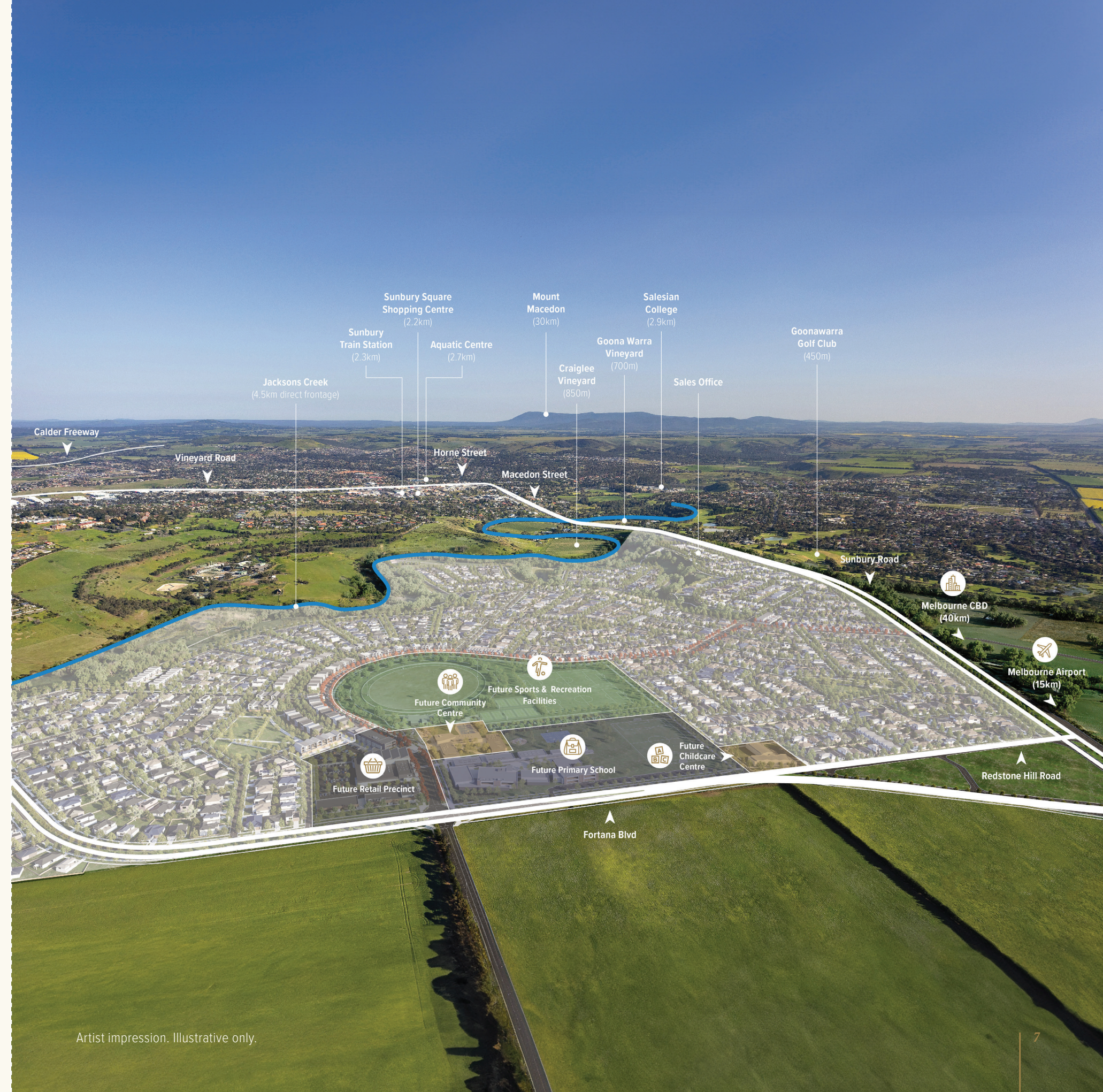
Artist impression. Illustrative only.

Opening the eastern side of Jacksons Creek allows residents the opportunity to explore the many bike and walking paths, scenic lookouts, and open space by the waterfront. The central placement of sports facilities within the community also serves as a testament to Everley's dedication to fostering a healthy and active lifestyle, while the wide array of housing options meets the needs of a growing population and dynamic community.