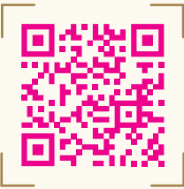
Scan to view Everley's prime location.

As Sunbury expands to meet the needs of a growing population, Everley's centrality will only continue to grow. With Sunbury Station just a short 5-minute drive away and Melbourne Airport only 20 minutes by car, Everley offers excellent connectivity to both Melbourne and regional Victoria.