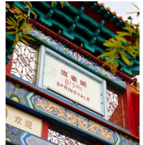
SPRINGVALE MARKET PRECINCT Buckingham Avenue, Springvale

Springvale’s bánh mì institution, Bun Bun Bakery was opened by a husband-and-wife duo over 20 years ago and serves lines of loyal customers with up to 1000 traditional, fresh-made rolls every day.