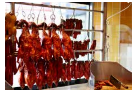
GOLDEN LAKE CAKE AND ROAST 46 Buckingham Avenue, Springvale

The epicentre of shopping in Springvale, brimming with fresh produce from an abundance of Asian grocers and home to many Vietnamese restaurants, as well as some great cafés.