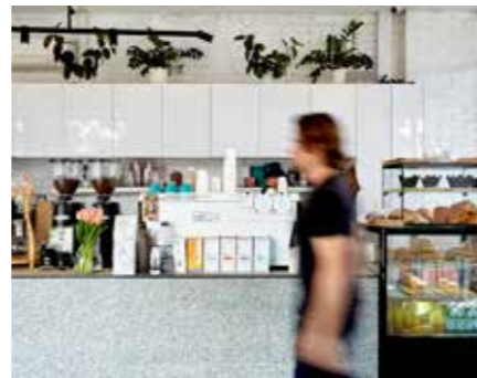
STRANGE SERVANT 109 Centre Dandenong Road, Dingley Village

Explore numerous paths and trails winding through stunning wetlands and bird sanctuaries amid a lush 20 hectare natural environment filled with 20,000 native trees.