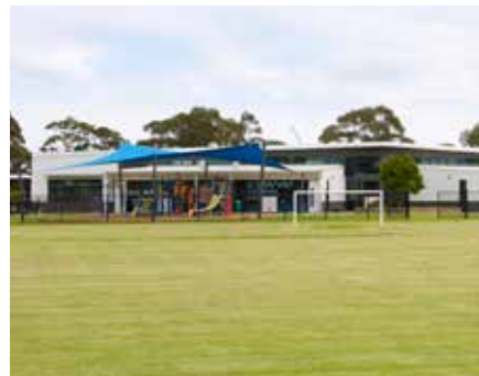
KEYSBOROUGH PRIMARY SCHOOL 31-53 Coomoora Road, Springvale South

A 300 hectare green oasis including wetlands, heaths and redgum woods, Braeside Park features a wide variety of birdlife, 12km of walking and cycling tracks, BBQ areas and a children’s adventure playground.