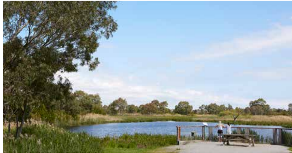
BRAESIDE PARK Lower Dandenong Road, Braeside

Make yourself at home in a local neighbourhood that offers a real sense of community and culture. Well-serviced by public transport, discover outstanding amenity – from stunning green parklands, golf courses and reserves to sensational market shopping and dining opportunities.