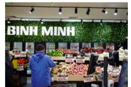
BINH MINH Springvale Shopping Centre, Springvale

Authentic yum cha takeaway with a delicious range of tender roast pork, succulent char siu pork and whole roast ducks, as well as bao, pastries and desserts — all freshly made in-house daily.