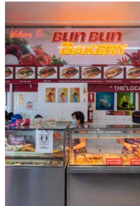
BUN BUN BAKERY 1, 288 Springvale Road, Springvale

Springvale’s bánh mì institution, Bun Bun Bakery was opened by a husband-and-wife duo over 20 years ago and serves lines of loyal customers with up to 1000 traditional, fresh-made rolls every day.