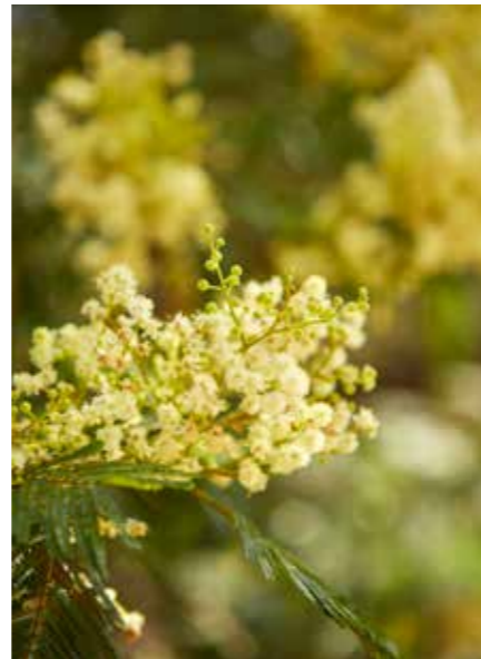
MAURIE JARVIS WOODLAND Lake View Boulevard, Keysborough

Explore numerous paths and trails winding through stunning wetlands and bird sanctuaries amid a lush 20 hectare natural environment filled with 20,000 native trees.