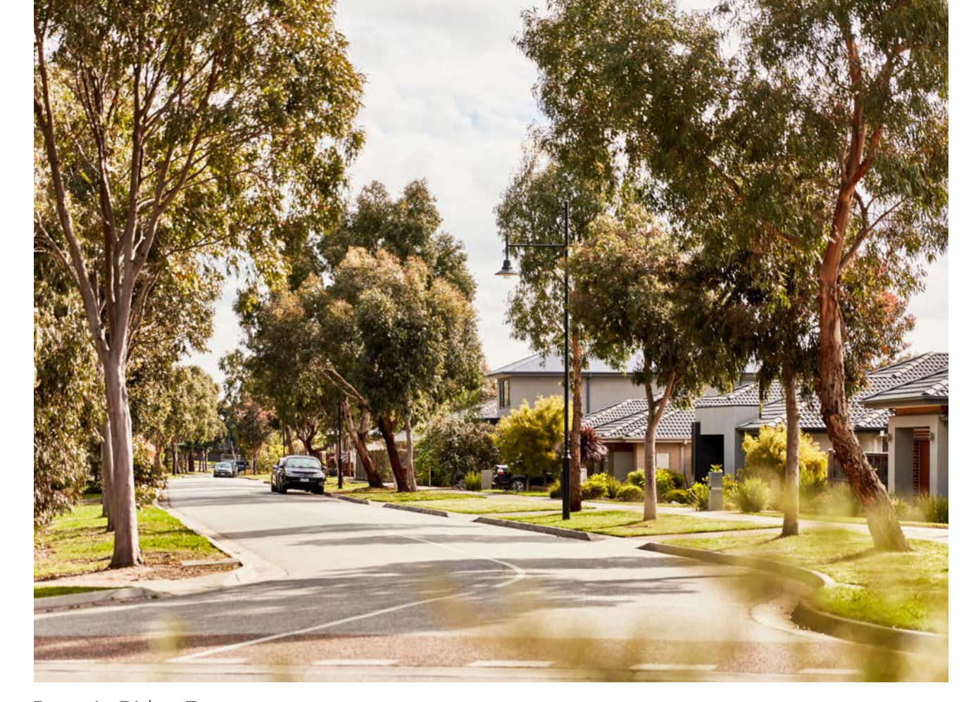
Botanic Ridge Estate

Begin the day walking or cycling along scenic neighbourhood trails or explore your very own natural wetlands. Stroll down to one of the many cafés nearby for a scrumptious breakfast and speciality coffee. Meet up with neighbours for a picnic at Botanic Ridge Central Park or lunch at one of the local dining venues.