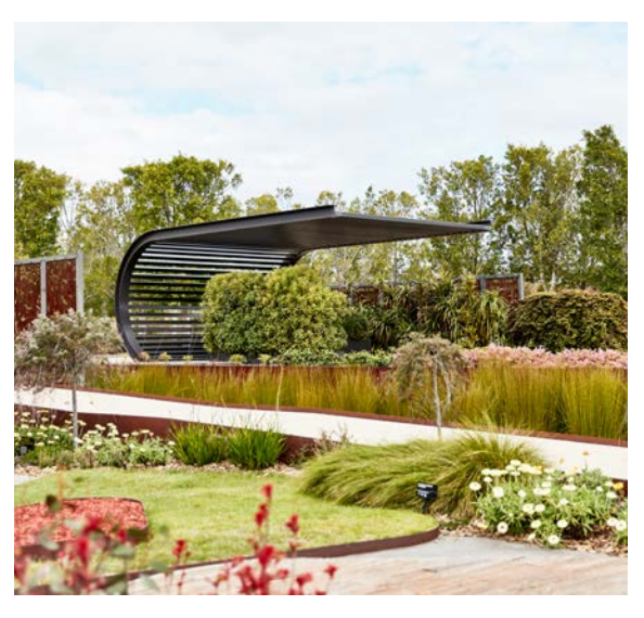
Cranbourne Botanic Gardens