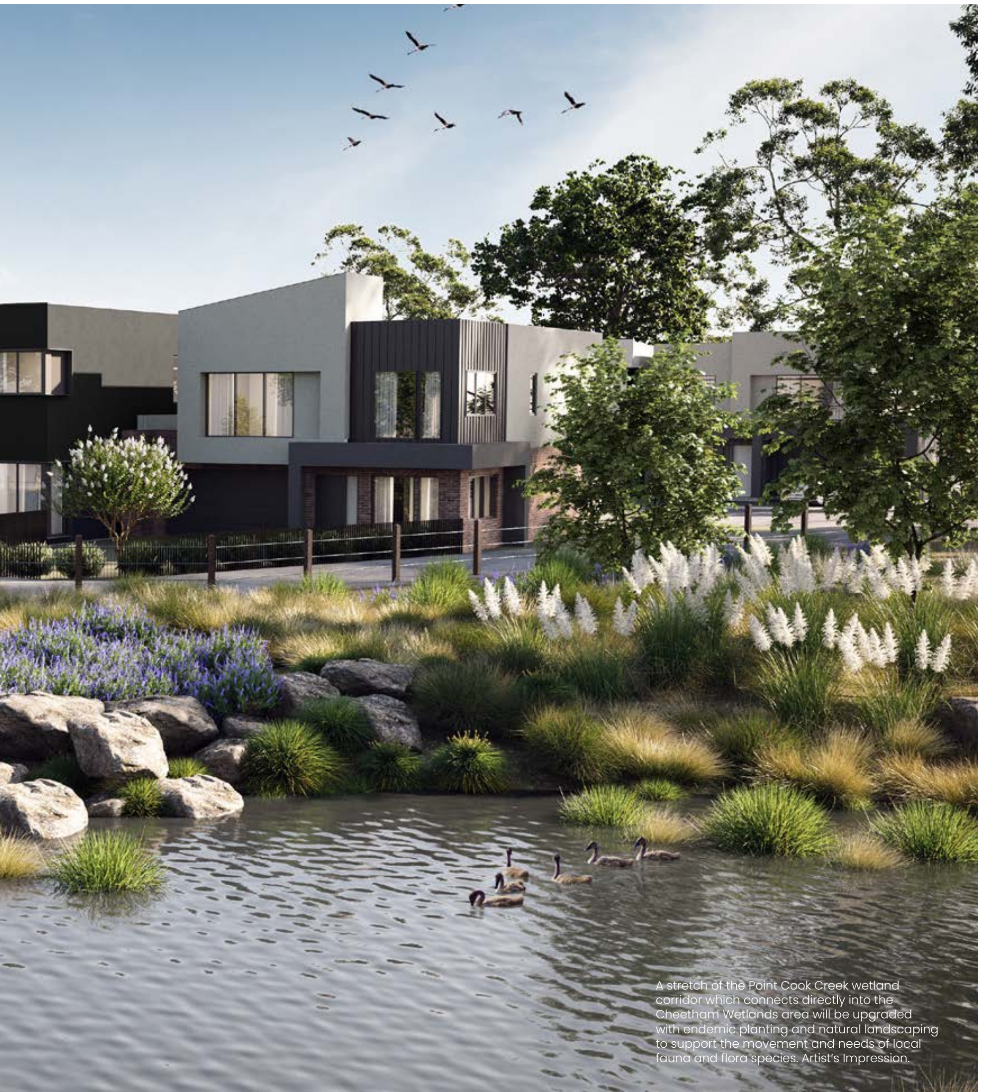
A stretch of the Point Cook Creek wetland corridor which connects directly into the Cheetham Wetlands area will be upgraded with endemic planting and natural landscaping to support the movement and needs of local fauna and flora species. Artist's Impression.