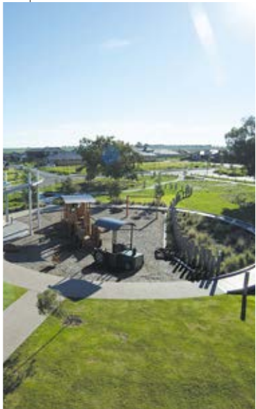
Summerhill - Epping North 800 Residential Allotments summerhillliving.com.au