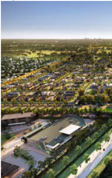
The Woods - Donnybrook 400 Residential Allotments wonderofthewoods.com.au