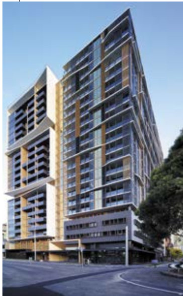
The Guilfoyle Southbank 353 Apartments / 21 Levels evolvedevelopment.com.au